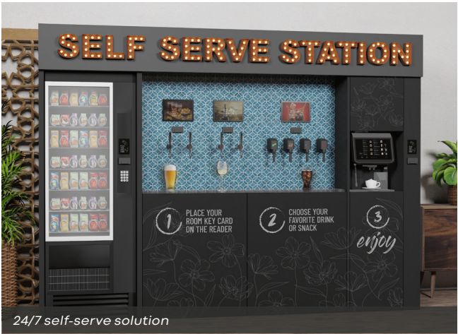
24/7 self-serve solution

The SILEXA Tower Combo allows for dispensing still and sparkling magnesium-mineralized water, along with two different flavors from a single column. It is ideal for use in conference rooms and offers maximum comfort and flexibility thanks to its compact design and a 2.8" touchscreen. Beautiful, freshly tapped carafes replace bottles, simplifying operations as the laborious task of hauling and chilling bottled mineral water is eliminated. The system contributes to an improved CO2 footprint, offers various flavors, and enables self-service during breaks, saving staff resources.