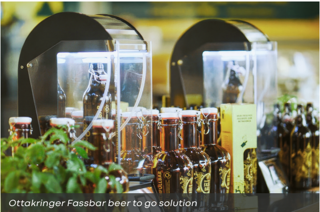
Ottakringer Fassbar beer to go solution